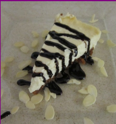
Chocolate Chip Cookie Crust