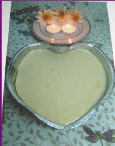
Heart Shaped Pan