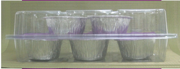
Set of Five miniature pack